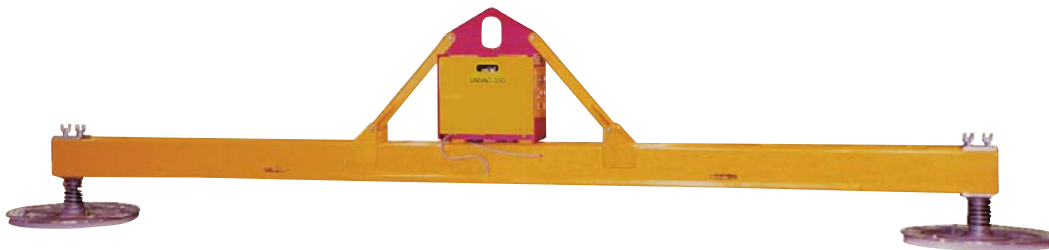
Twin pad unit with sling for long heavy rigid material and silicone vacuum pads for handling hot plate.