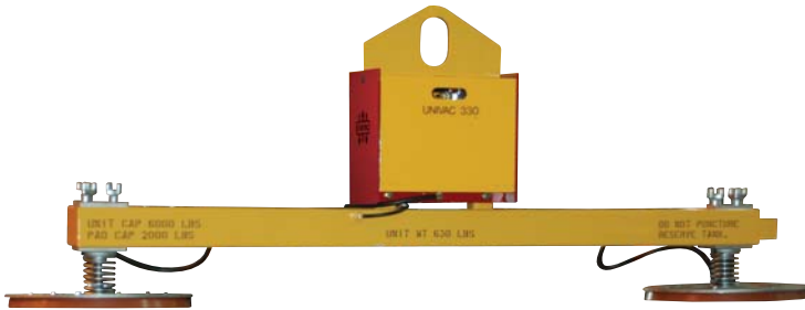
Custom designed bail for large crane hook.

For lifting smaller rectangular shaped material. Width should not exceed 5 times the pad diameter (see specifications below for pad diameter).