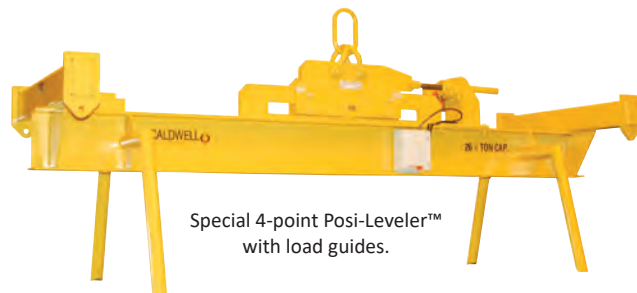
Special 4-point Posi-Leveler™ with load guides.