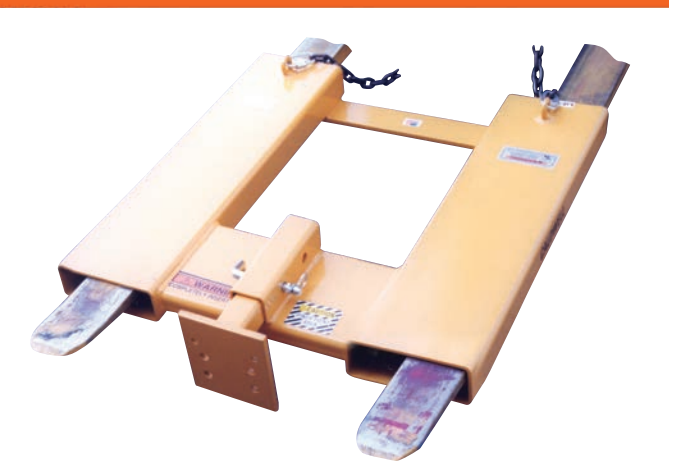
Shown with optional pintle adapter.