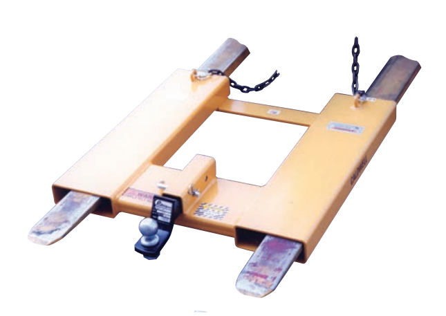
Shown with optional hitch insert & ball.