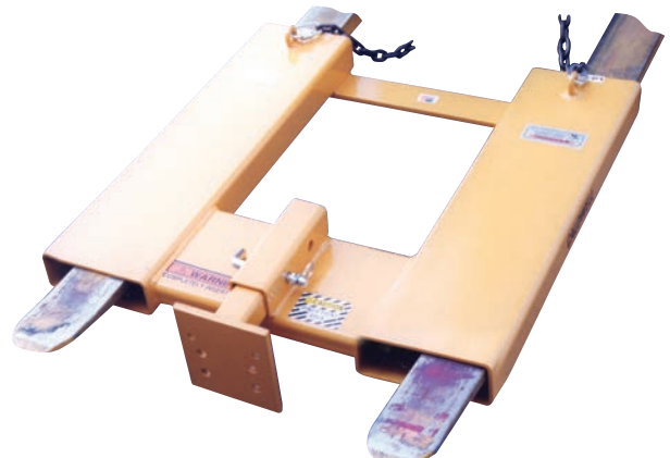
Shown with optional pintle adapter.