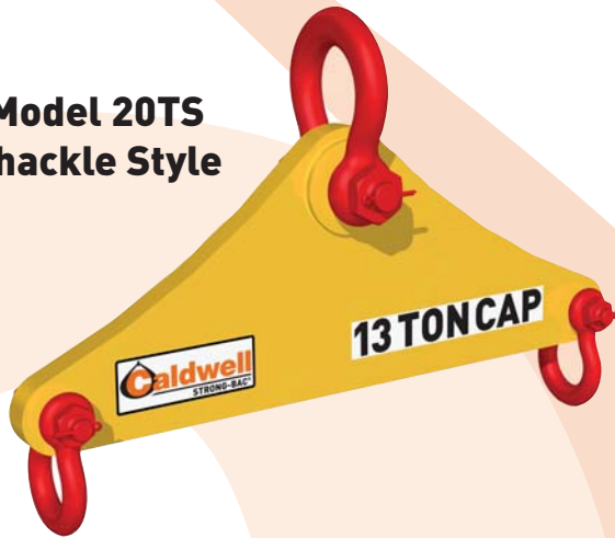
Model 20TS Shackle Style