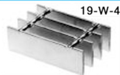
Cross Rods 4" C/C