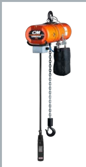
CM Lodestar® VS Electric Chain Hoist