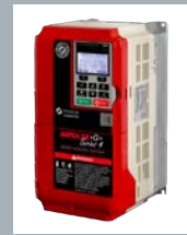
IMPULSE®-G+/VG+ Series 4 or IMPULSE®-G+ Mini VFDs