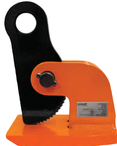
Low-maintenance, fewer components. Gripping cam does not activate until you begin the lift.

The Model LHC is a horizontal lifting clamp intended to be used in pairs, sets of pairs or in a tripod arrangement for transporting steel plates horizontally. The clamp is designed to lift individual sheets horizontally. Cam operations ensure a tight grip on the load. Serrated gripping cam bites into load for positive grip. Clamps rest in position on edge of plate until tension is applied to the load sling. Clamps must be used in single pairs (2), double pairs (4), or tripod (3) configuration with a lifting sling.