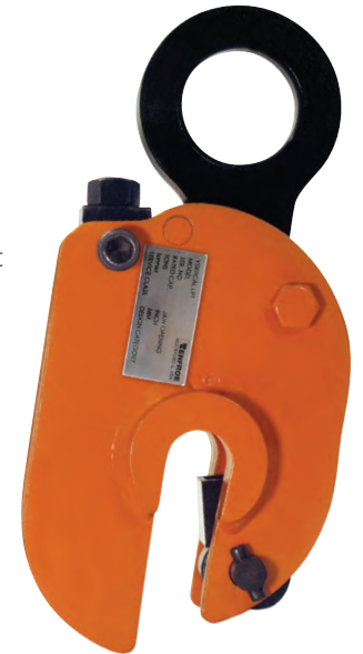
Non-marring with 90-degree turn only.

The Model NM clamp (non-marring) is manufactured with smooth gripping surfaces to prevent marring when gripping stainless steel, copper, aluminum and other polished metal plates. Due to the variety of conditions that may exist in handling these plates, it is recommended that these clamps be used in pairs and attached to a chain or wire rope sling, supported by a spreader beam. The Model NM is supplied with stainless steel gripping surfaces and is available with steel or bronze upon request. The Model NM is not intended for use in transportation of plates using mobile equipment where shocking of the load may occur.