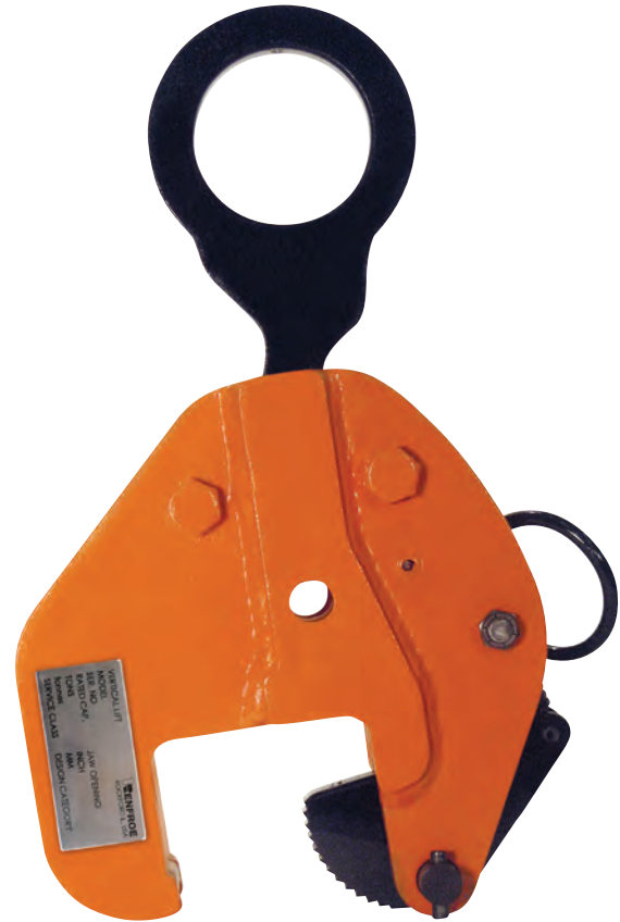
The best choice for lifting crane rails and railroad rails.

The Model DG rail clamp is used for lifting and transporting crane rails and railroad rails. Lightness of weight allows it to be hand applied and hand removed. The Model DG possesses all the features of the Model FR. All the repair parts are identical to same tonnage of the FR, except the swivel jaw has been eliminated.