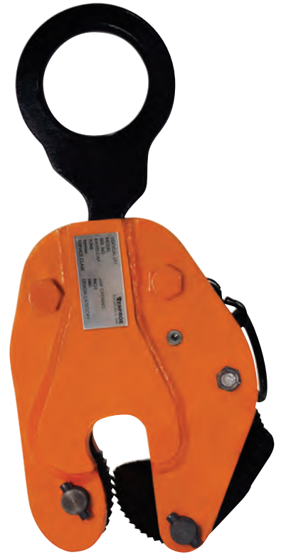
Similar to the Model FR with serrated cam jaw.