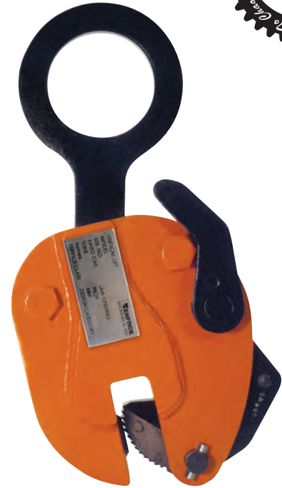
Lock assembly on the outside of the clamp, plus higher lifting capacity.