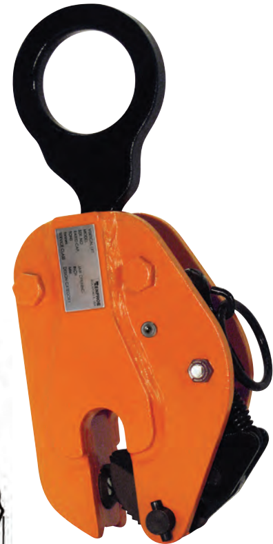
Lock assembly is inside the clamp body to keep it out of the way.

The Model FR is a vertical lifting tool for relatively light work. It is small and easy to handle in capacities through three tons. It incorporates a “Lock Closed” feature which facilitates attaching the clamp to the plate.