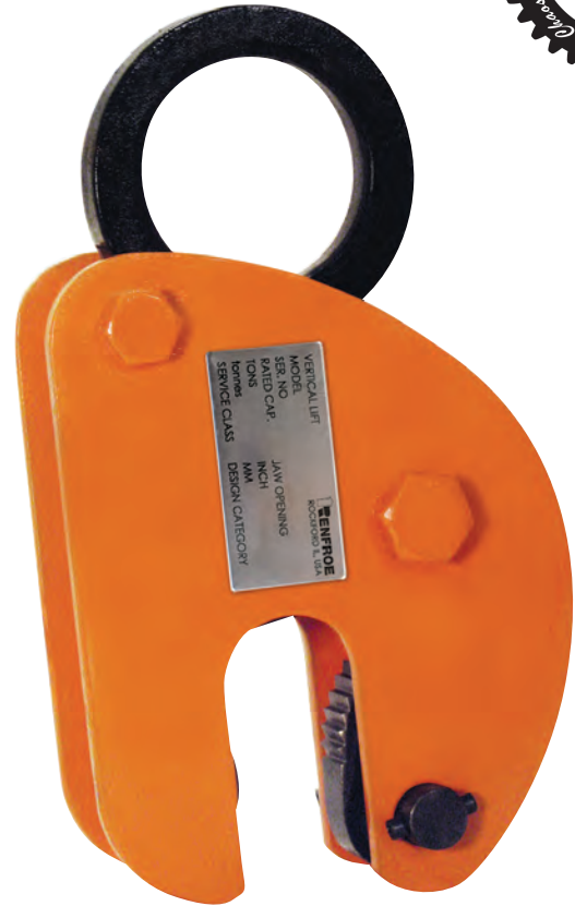
Non-locking, affordable, low-maintenance.

The Model BD is a vertical lifting, non-locking clamp used primarily for steel warehousing and bench work where a locking type clamp is not essential. The clamp is a low-cost, low-maintenance tool that features lightweight and compact size. It is recommended for use and application where constant tension is applied to the lifting shackle throughout the entire operation.