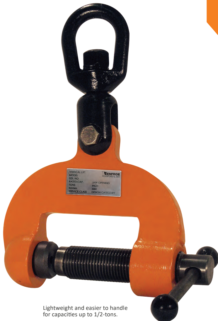
Lightweight and easier to handle for capacities up to 1/2-tons.