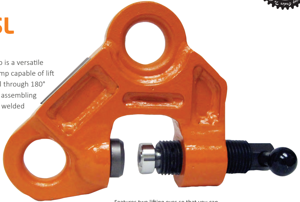
Features two lifting eyes so that you can reposition the lifting shackle to pull better.

The Model PCK-SL Locking Screw Clamp is a versatile multi-purpose lifting turning pulling clamp capable of lift and turn operations from the horizontal through 180° arc. The clamp can also be used for the assembling of steel plates, structural members and welded sections. The clamp is generally used in pairs for the purpose of drawing two plates or members together or to a predetermined position adjacent to each other. The adjusting screw is used to accommodate various thicknesses of material and to facilitate the attachment of the clamp to the member being worked on.