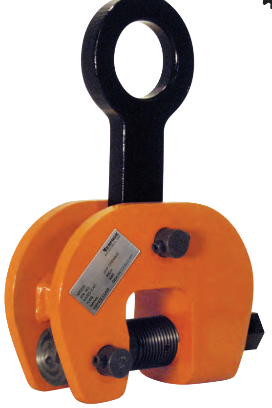
Heavy-duty screw-clamp version of the Model RSC.