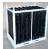
For Class A services, to keep items clean, scuff free