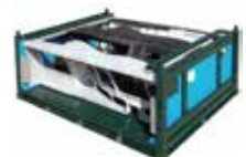
Customizable, specialty racks