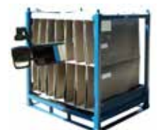
Safely ship glass, windows