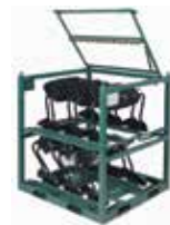
Fragile items such as mirrors