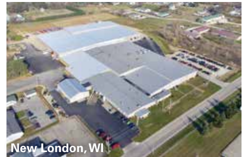
New London, WI