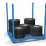
Ship items not requiring separation