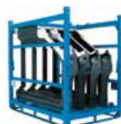
Large items such as vehicle doors