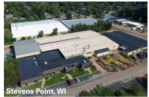
Stevens Point, WI