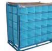
Pigeon hole racks for product separation