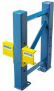
Sanitary unit shown