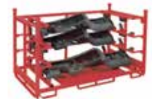
Ship electronic panels with product separation

Steel King will alter the size, dunnage, weight capacity, construction materials to make a shipping rack that fits your product. Our racks are structurally stable for up to 2- or 3-high shipping, and up to 6-high warehouse stacking.