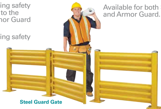
Steel Guard Gate

Steel King's self-closing safety gates use heavy, 11-gauge corrugated steel rails and are designed to fit a 48" post-to-post center line within a protective railing system.