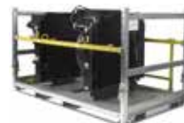
Ship multiple, oddly shaped items