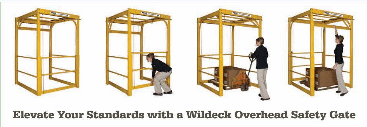
Elevate Your Standards with a Wildeck Overhead Safety Gate

You'll be glad you specified a Wildeck Overhead Safety Gate – because quality and safety matter.